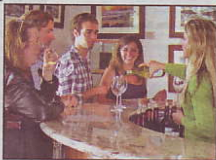
Enjoying the organically grown estate Chardonnay at Silver Mountain's tasting room and gallery.

In the Swift Street Courtyard, Santa Cruz Mountain Brewing serves up a dozen different organic micro-brewed beers and